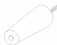
Part A x 4